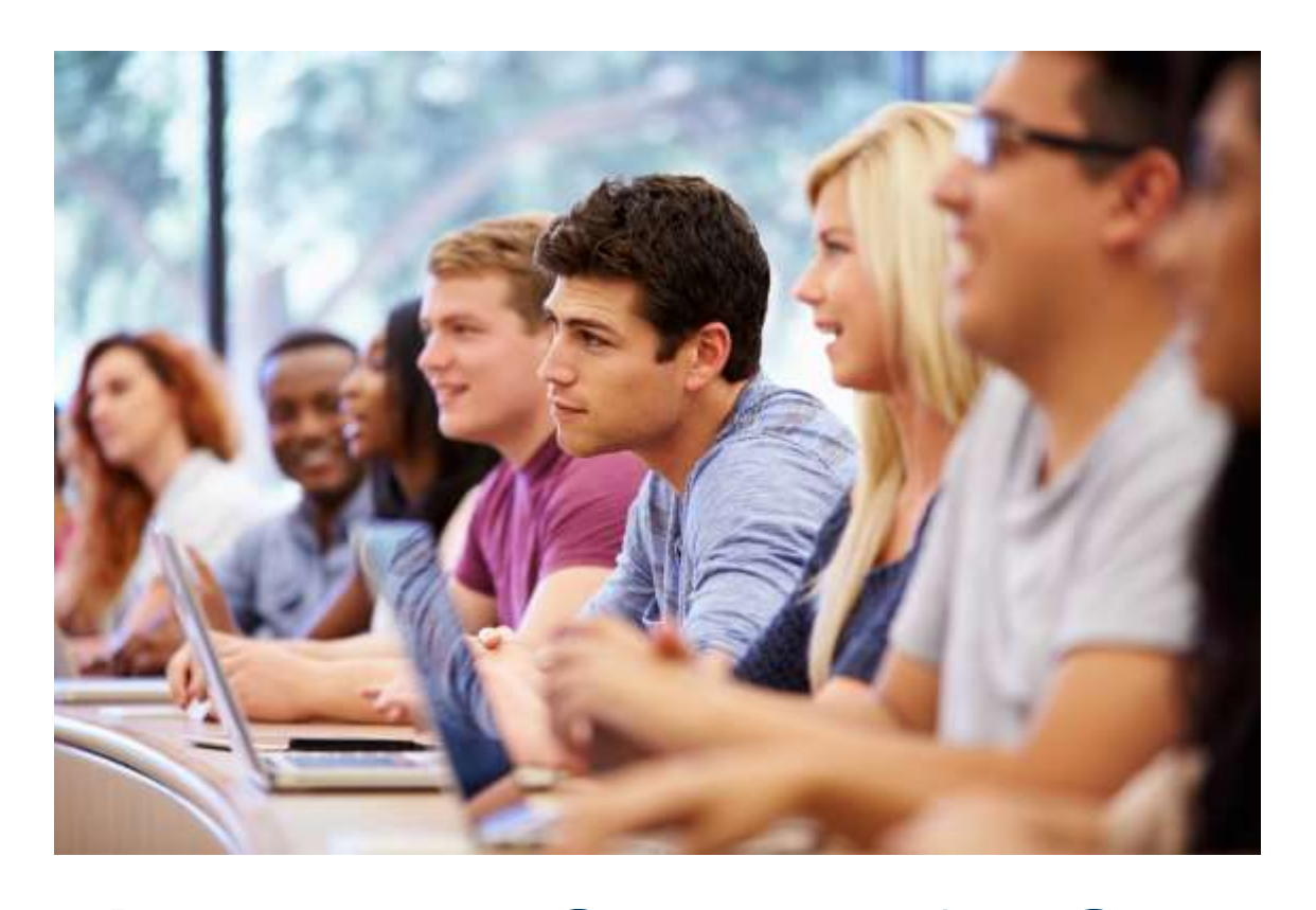
Wishing You a Successful Start to