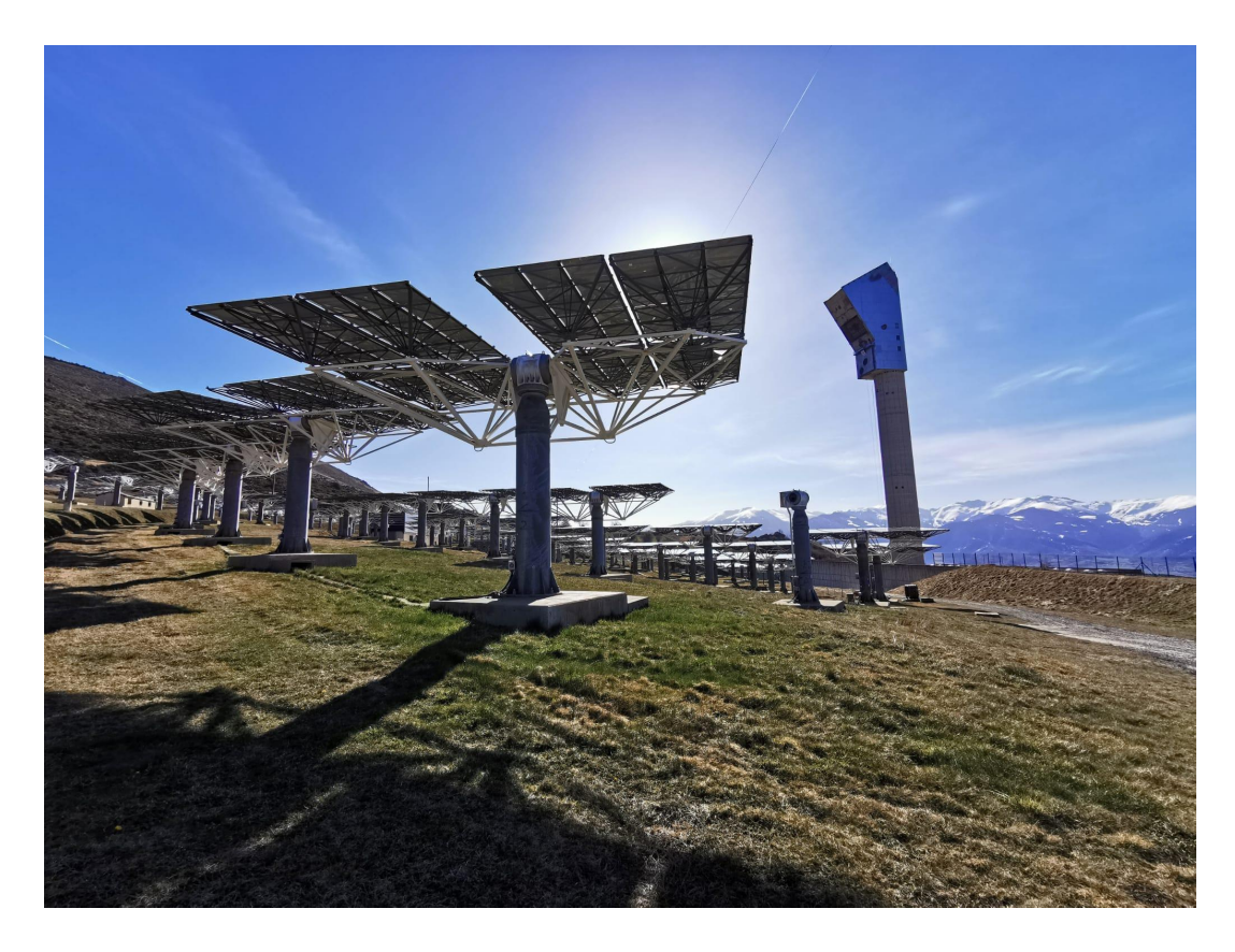
Picture 3: THEMIS Solar Concentration Plan near the Solar Furnance Center.