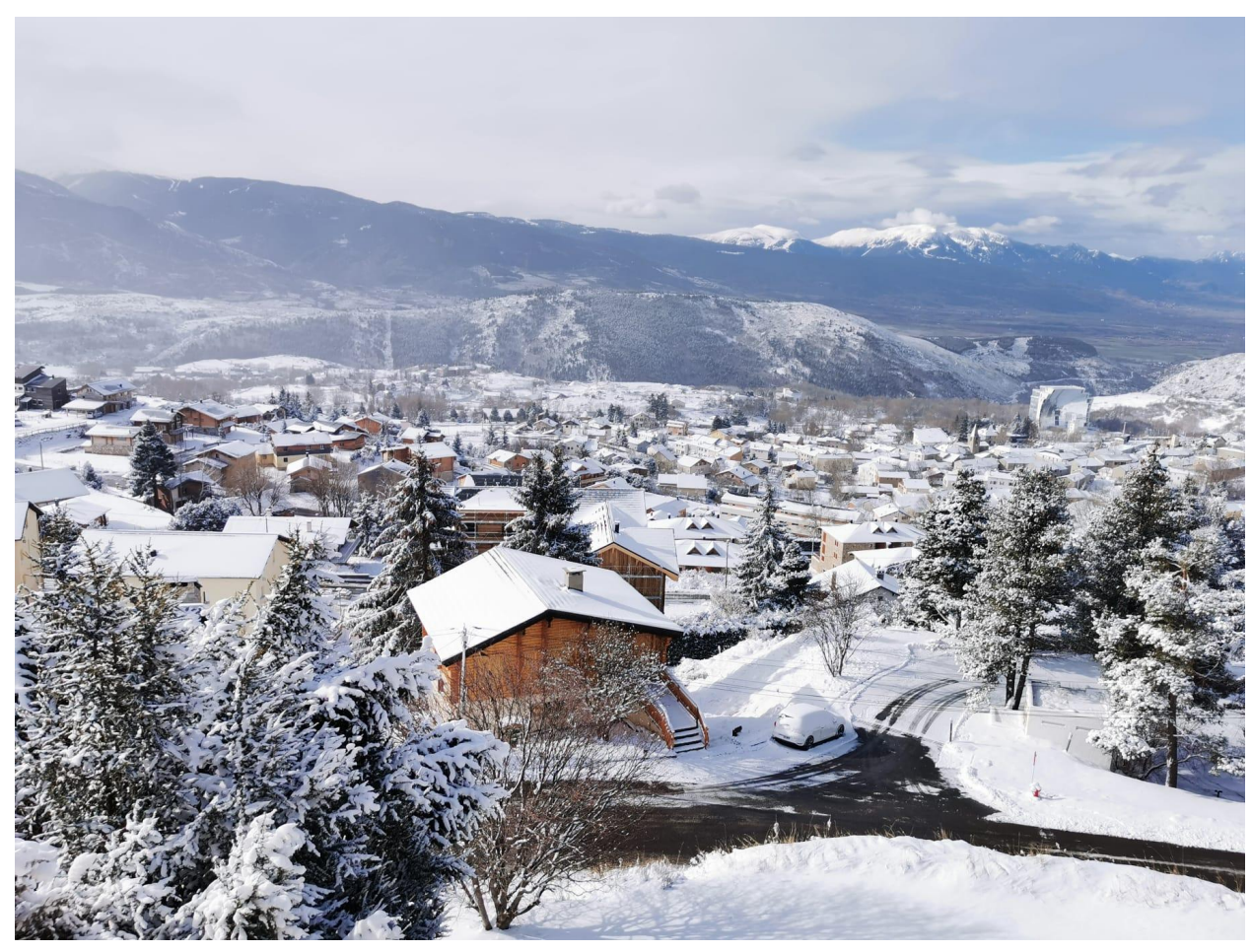
Picture 1: this was my every morning window view in Font-Romeu-Odeillo-Via, you can see the Solar Furnace Center on the right side downhill.

At the University of Perpignan, Solar Fournance PROMES-CNRS Center in Font-Romeu-Odeillo-Via