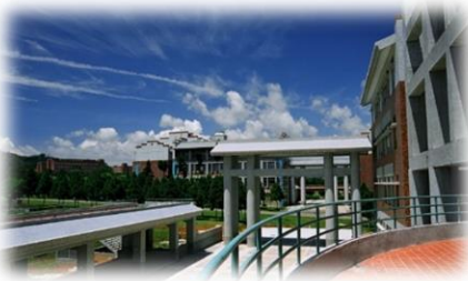
College of Education