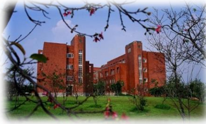
College of Science & Technology