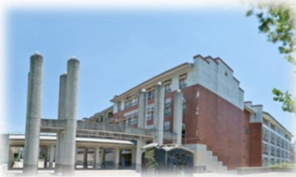
College of Humanities