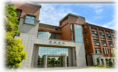
College of Management